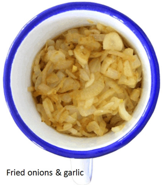
Fried onions & garlic