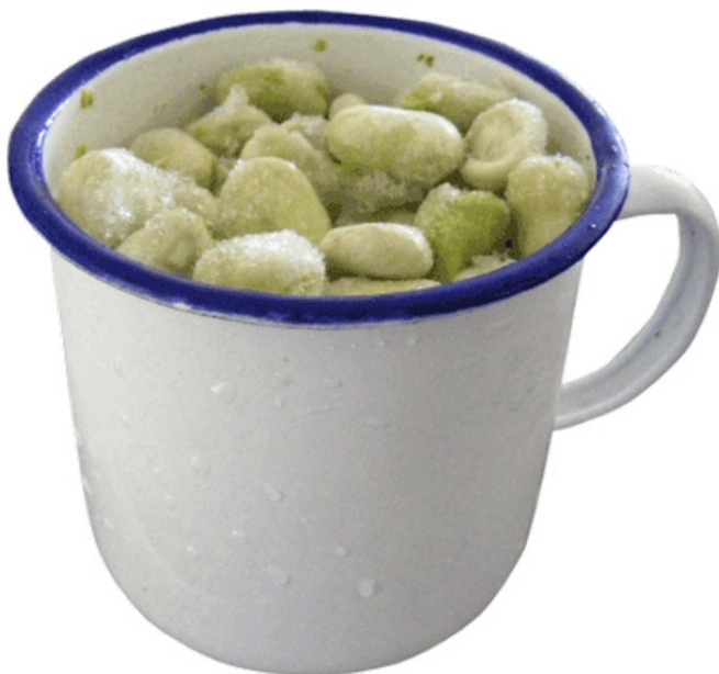
Frozen broad beans