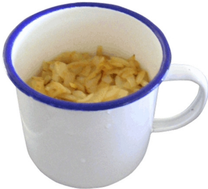
Fried onions & garlic